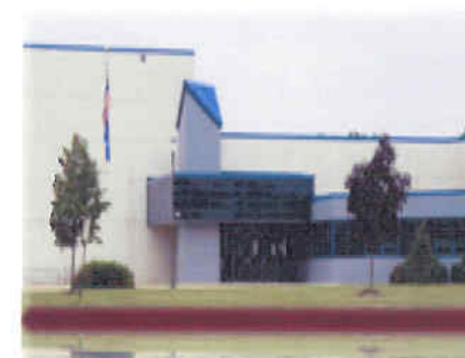
Hortonville Middle School