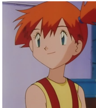
Misty, a witness to Ash's escape from the Sparrows, is also a young trainer with a love for water Pokémon.