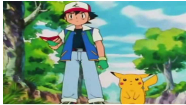
Ash Ketchum, the boy who claimed to see the legendary Pokémon, with his trusted Pikachu.

Unfortunately for the young water trainer, Ash had already destroyed her bicycle in a fevered attempt to escape the angry Sparrows. As the birds circled, and the fresh trainer braced fearing death, his Pikachu sprang up and baffled the swarm with a flash of lightning, knocking out itself and its master as well. As the clouds parted and the duo awoke from their loss of consciousness, they claimed they were greeted with the most extravagant of sights. Ash believed that he saw the legendary Ho-Oh hovering over the forest as the sun rose over the horizon, and, though few choose to believe him, little can be said about what really happened on this adventurous day.